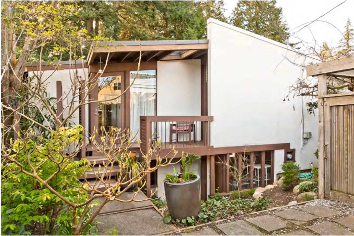
The back garden is a mix of paving stones and a flourishing green garden. The wooden gate to the right leads to a two-car parking spot.