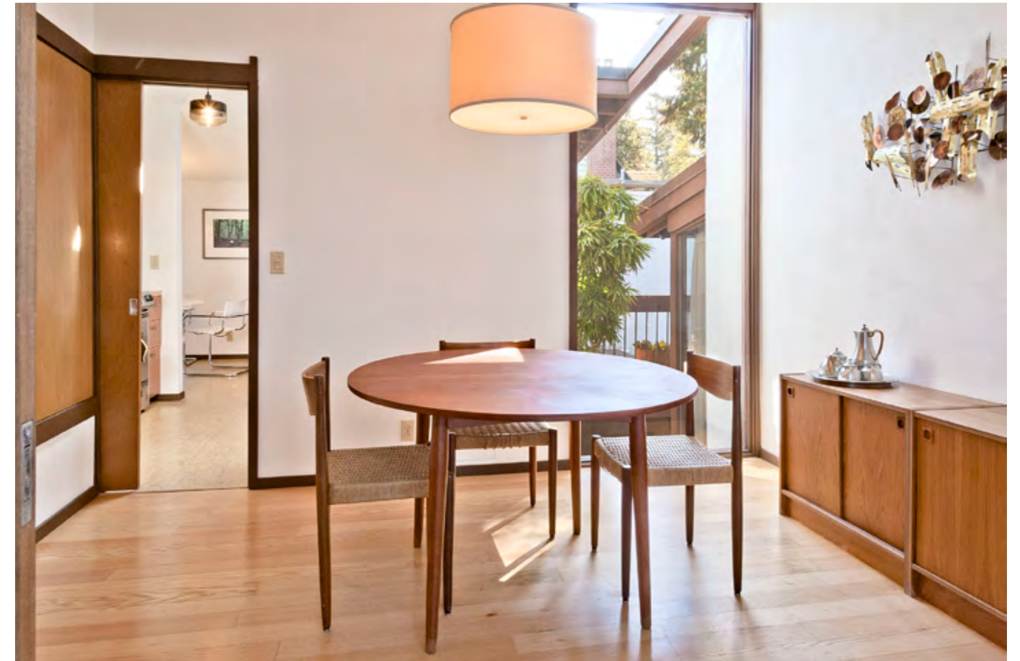
Like the rest of the house, this intimate dining area brings the outdoors in and depicts a modern sensibility. Kitchen with second eating area is seen past the single sliding door.