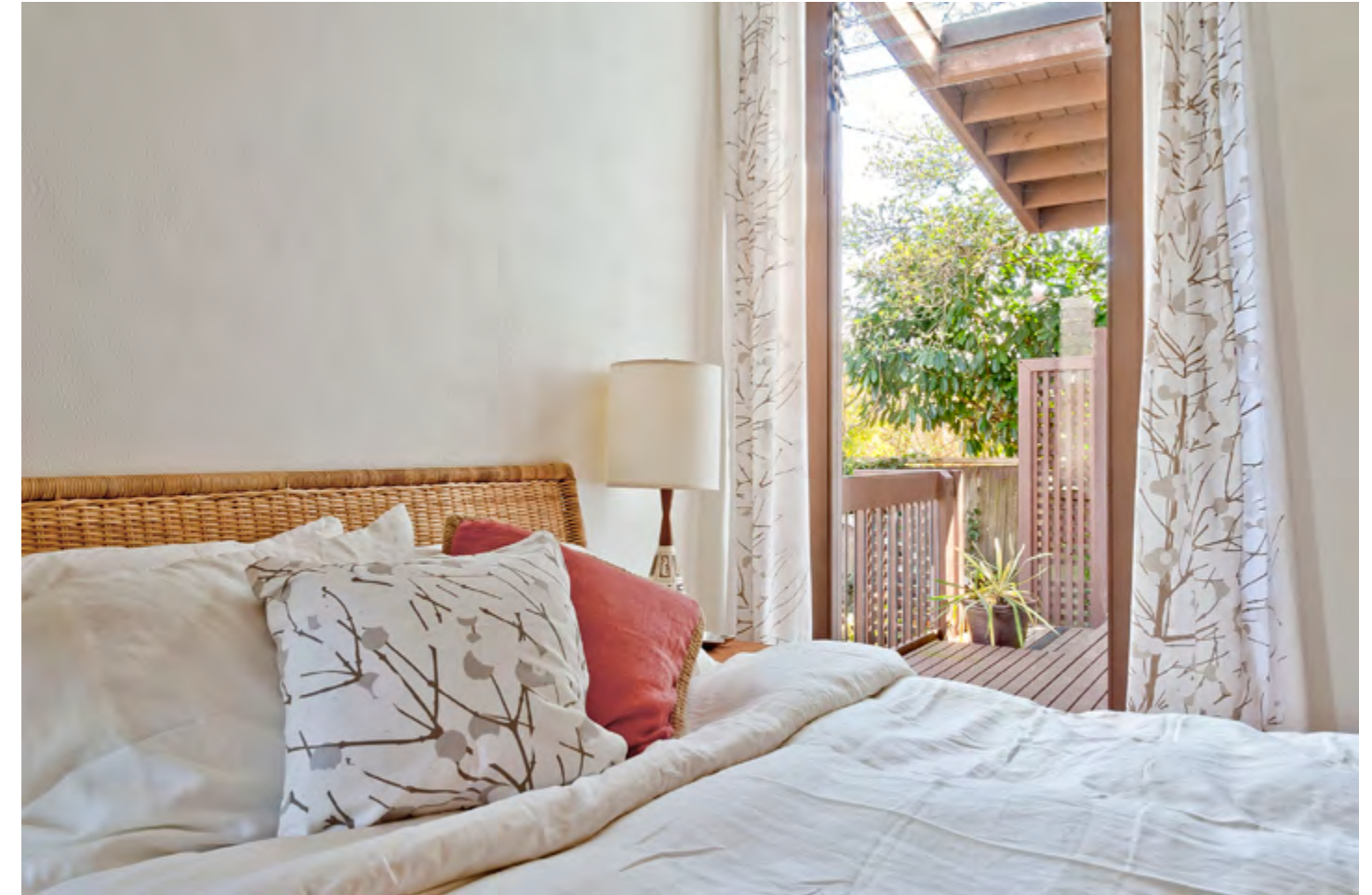
The master bedroom's south window overlooks the back garden.