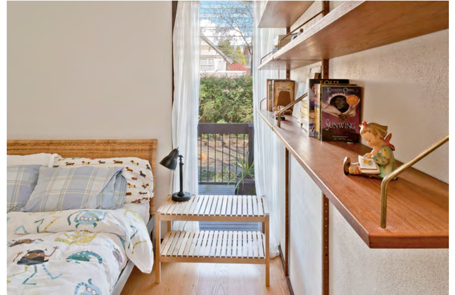
The second bedroom faces east. Like some other walls in the house, the wall to right in photo has the attractive texture of sand.