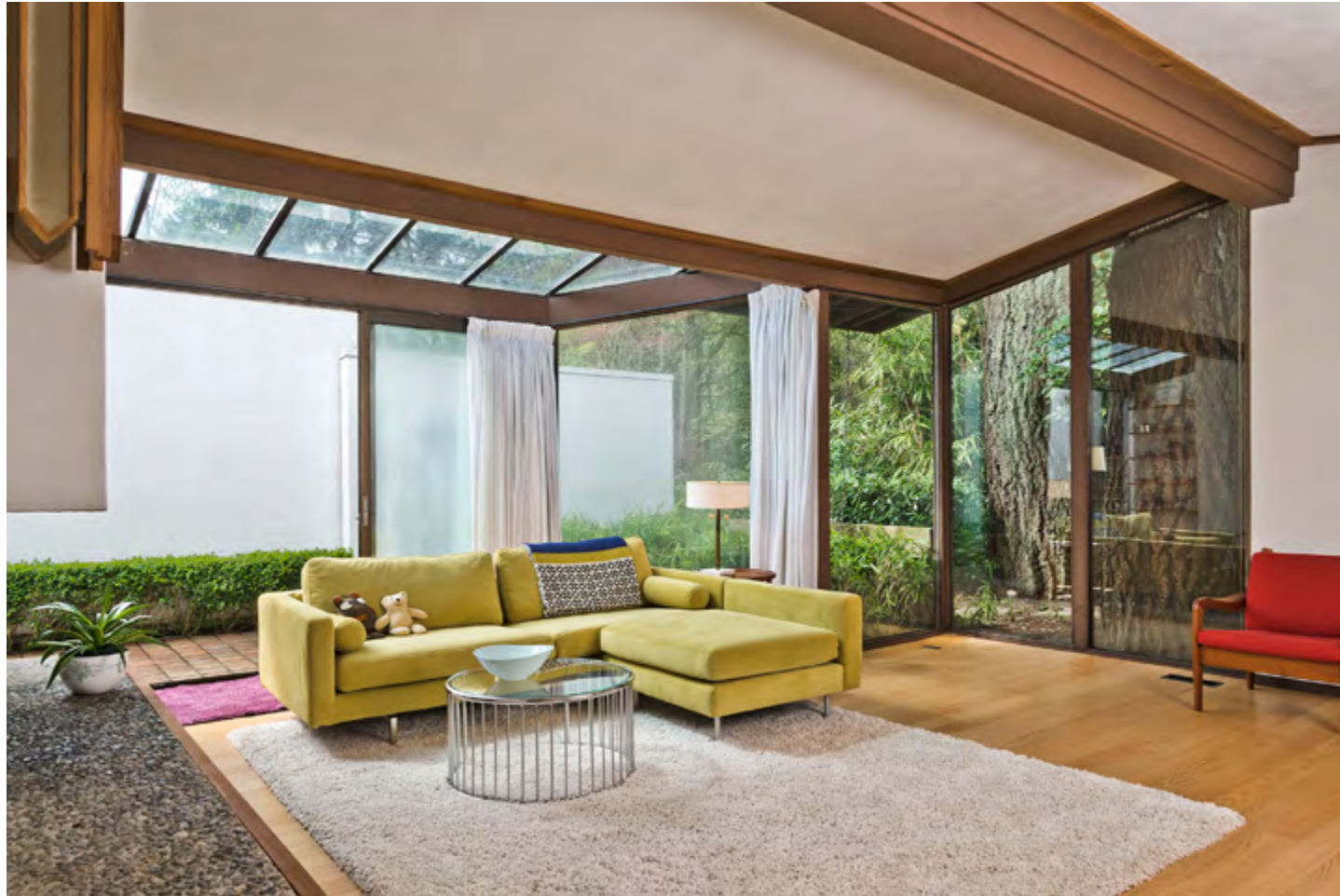
The living room has a distinctive overhead beam, and along the length of the south side a patio provides a private outdoor enclave.