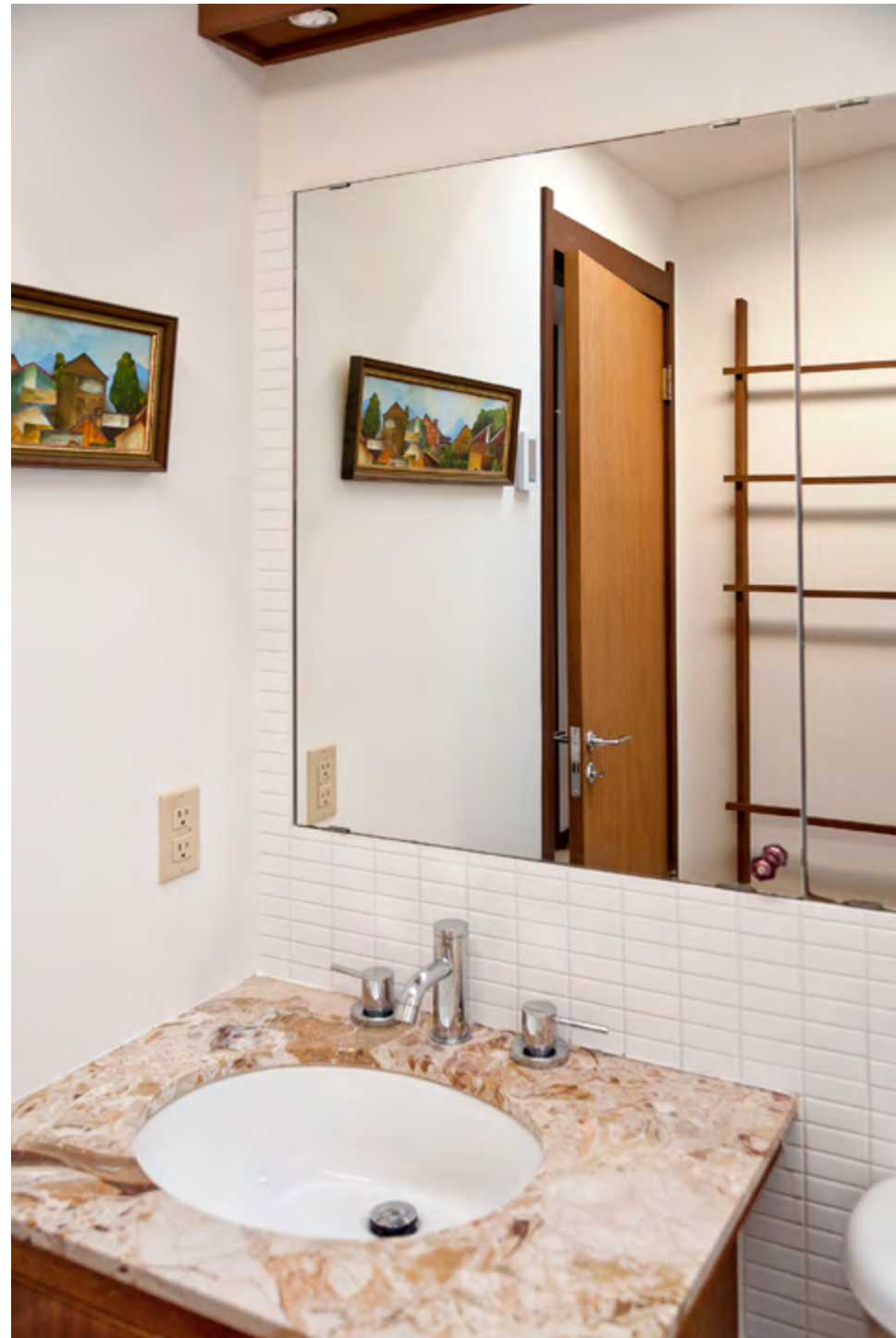
A full bathroom is next to the master bedroom on the main floor. Not shown is a bathtub and shower with a rainshower-style head. The room is further illuminated by an overhead skylight.