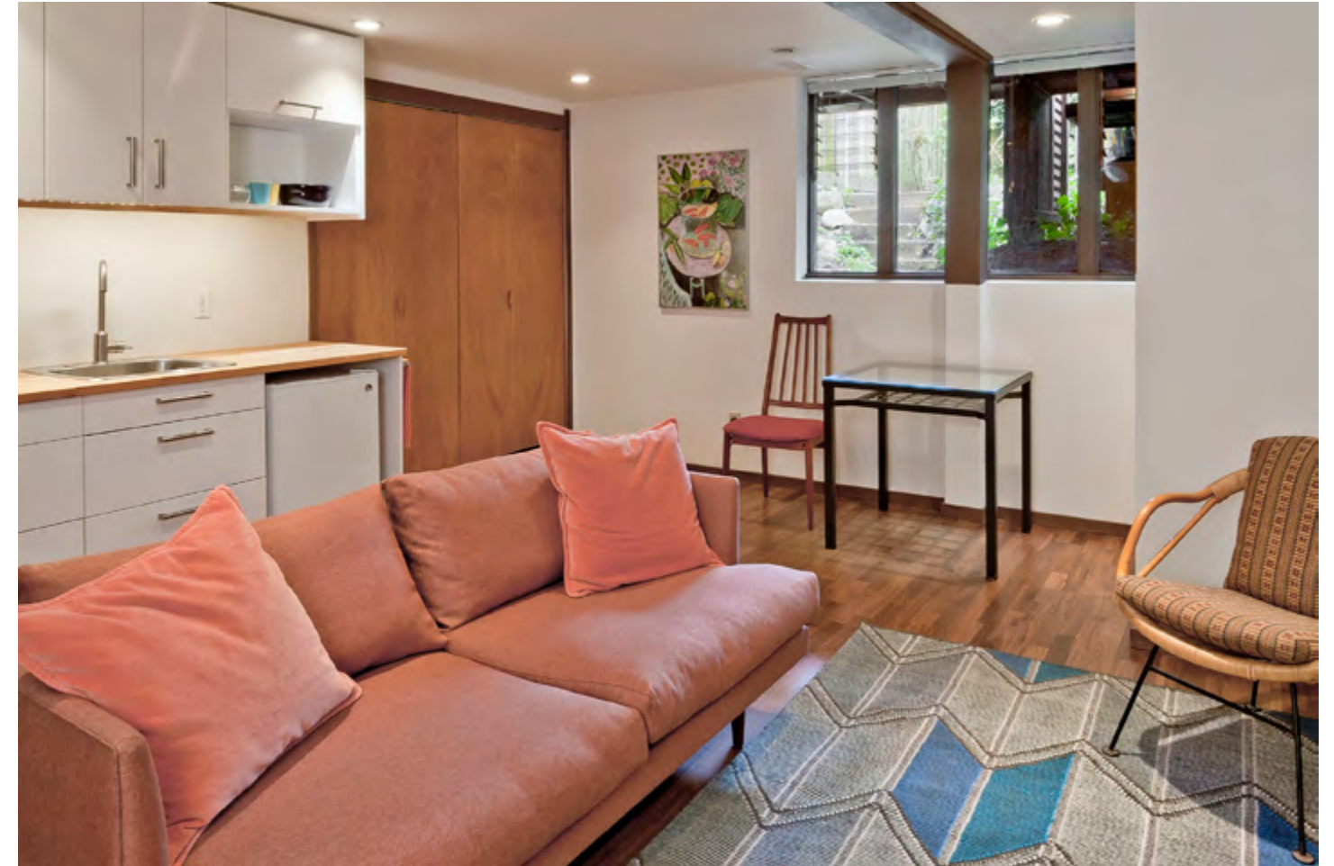
Also downstairs, around the corner from the bathroom, a recreation room could serve as a self-contained studio for a UBC student. Excellent bus service only two blocks away.