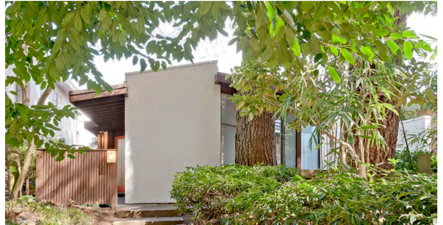
A gem of West Coast Modern design with its indoor-outdoor confluence, this is a home to treasure.