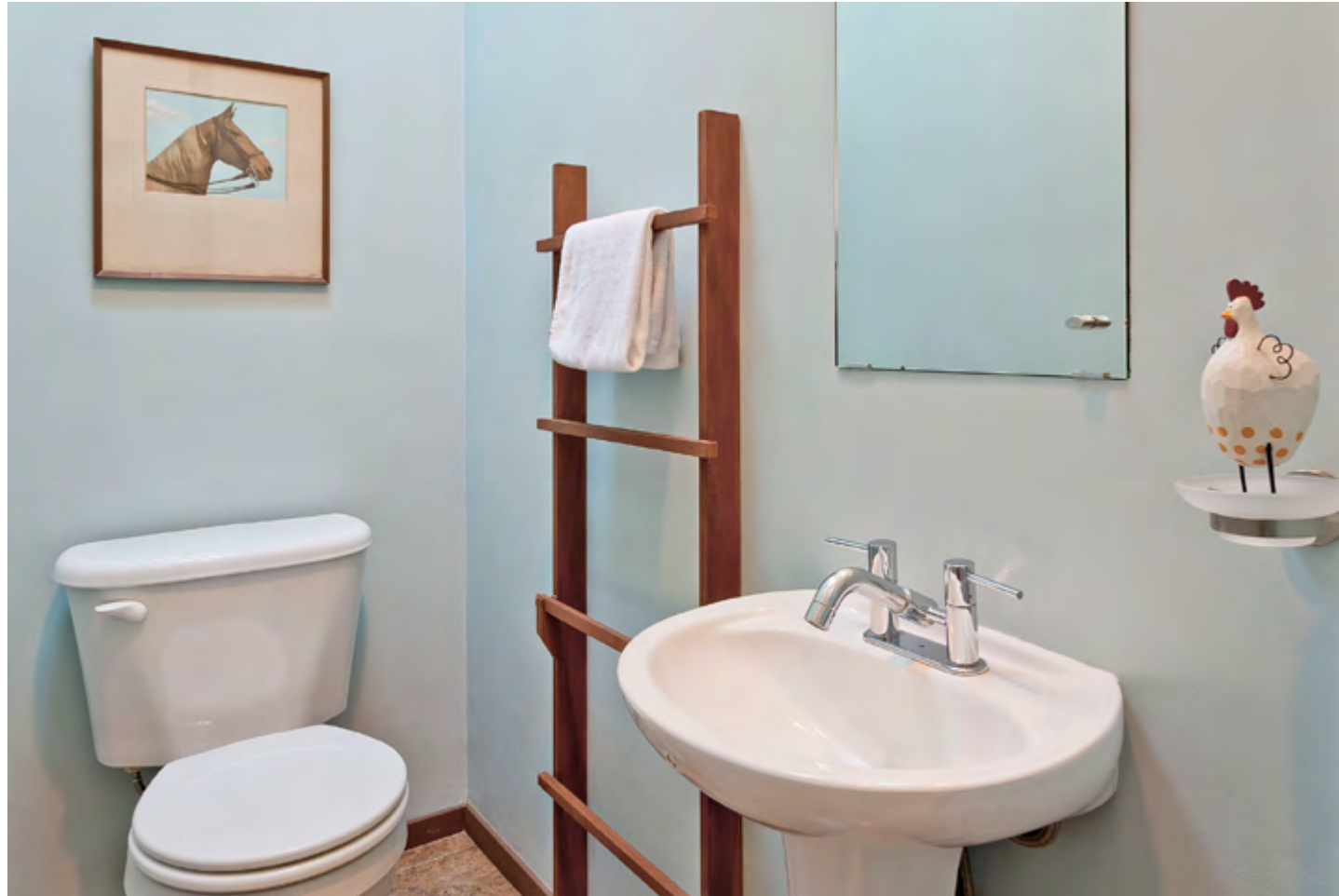
In addition to the full bathroom next to the master bedroom, this powder room serves the main floor and is located close to the second bedroom.