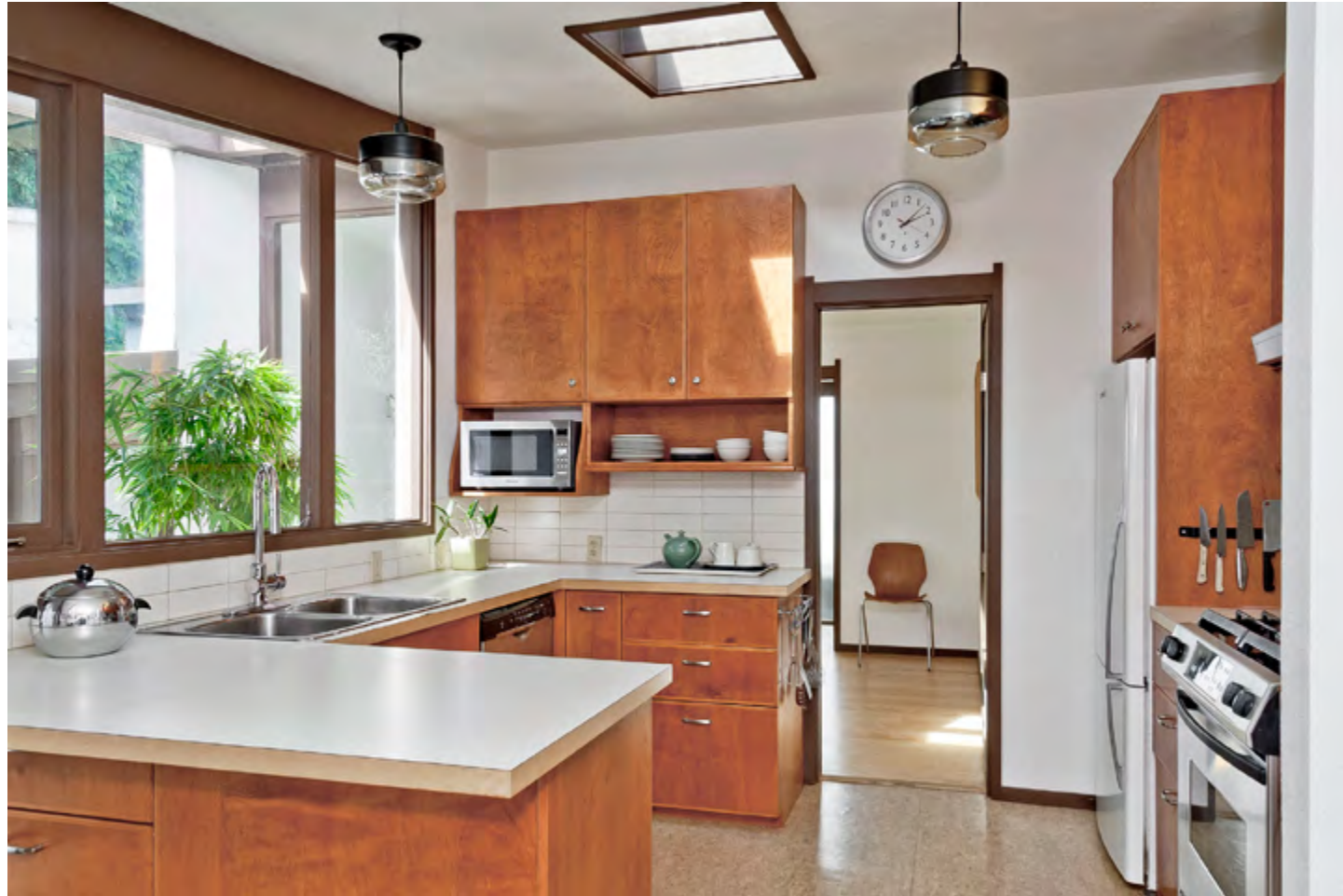
Functional and complete, the kitchen is between two dining/social areas and is equipped with a robust gas stove, skylight, and a window over the sink with a view of the patio and the forest canopy beyond.