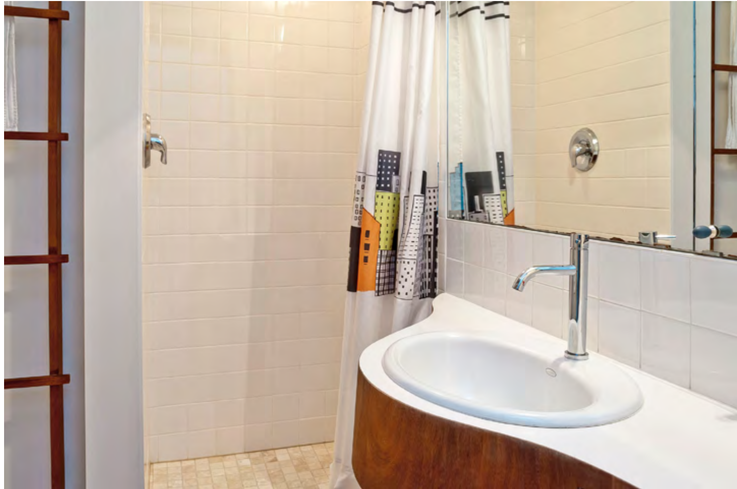
Downstairs, the bathroom sports a tiled shower and custom-built bow-front vanity.