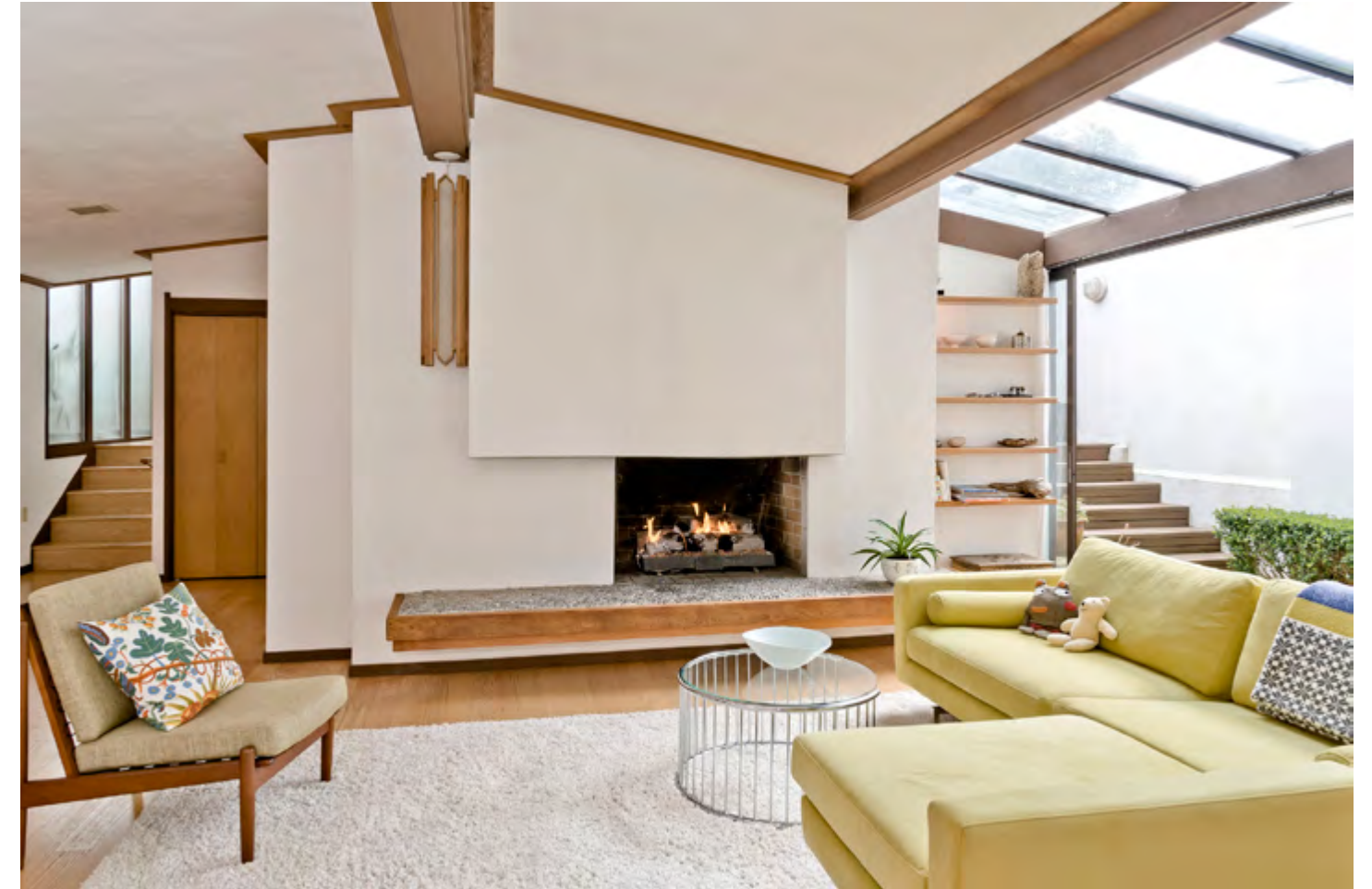
The main entrance (front door to left, not shown) leads to the den and the stairs to a window-lined hallway and central living area. A signature Barry Downs light fixture is to the left of the living room fireplace. A second gas fireplace is located behind the one shown, in the den (see page 15). Step through south-facing sliding doors and up the stairs for a direct connection to the kitchen.