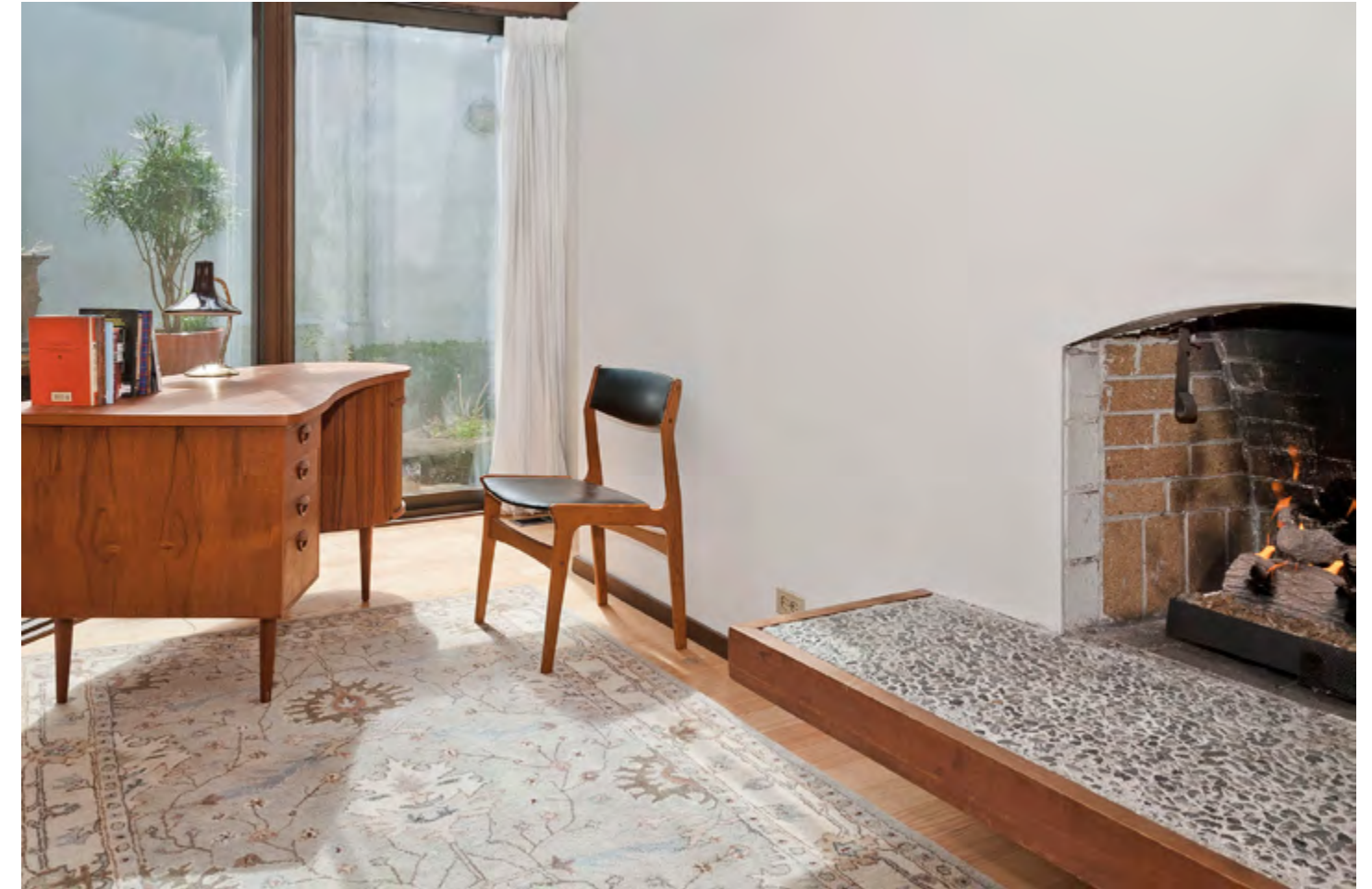
This side of the double fireplace (see page three, living room) opens into a den that can also be used as an office or guest room. Floor-to-ceiling windows overlook patio, with kitchen to left.