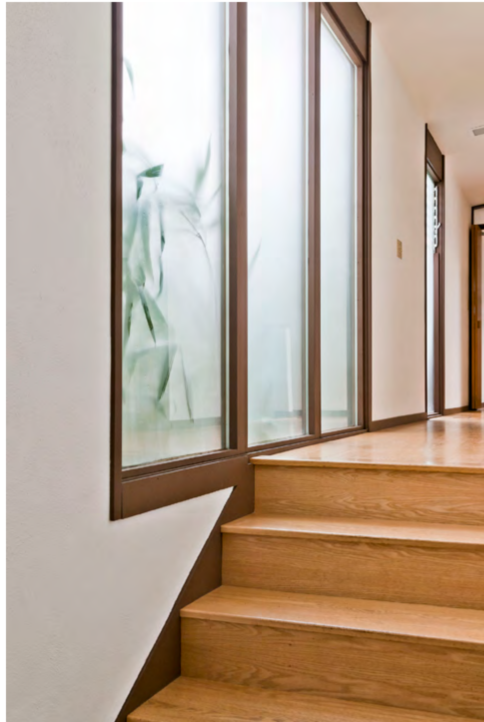
Natural light filters through translucent glass to illuminate the stairs and hallway. Adjoining the hall are double sliding doors (not shown) that open to the dining room.