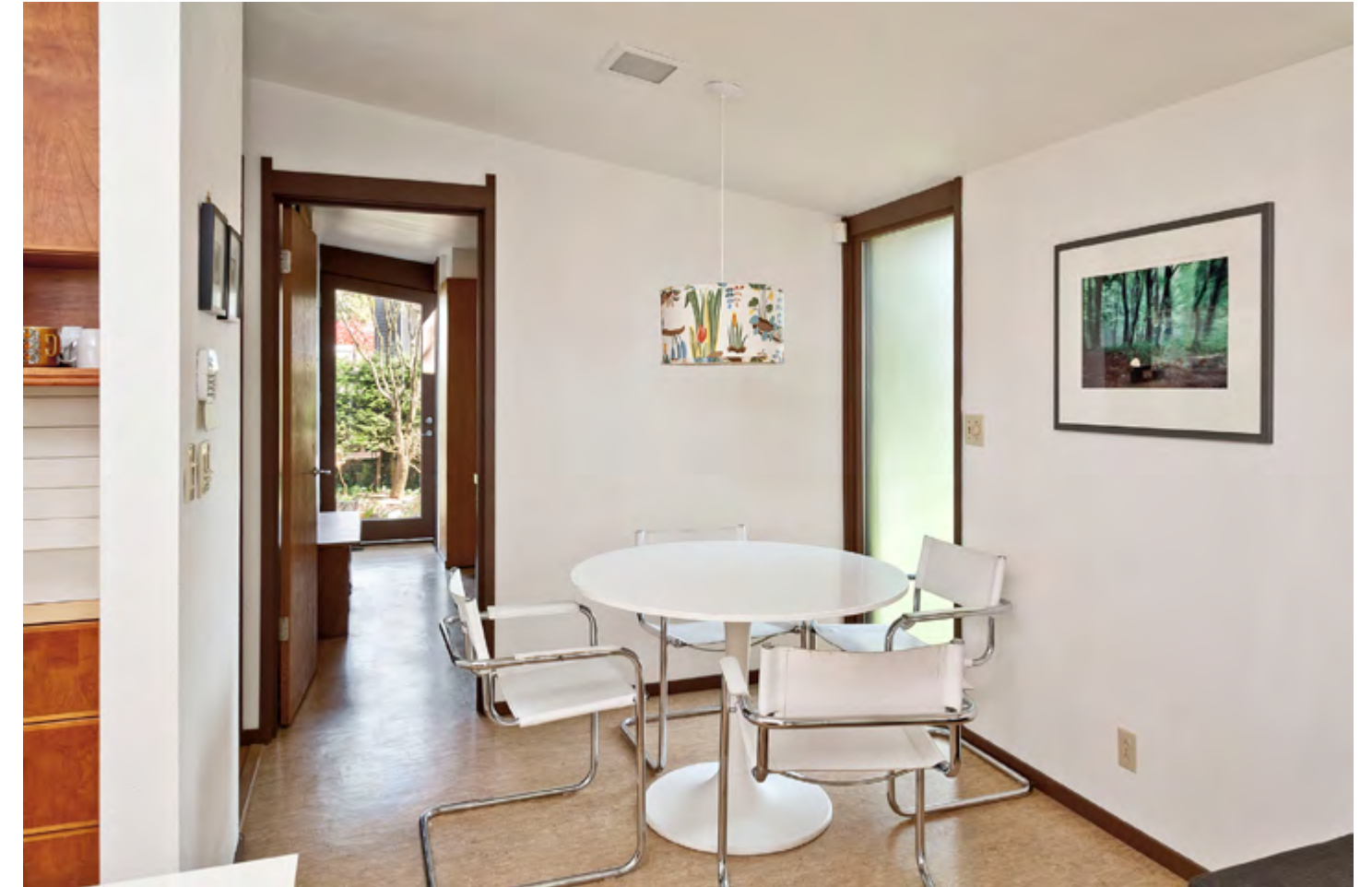
A characteristic floor-to-ceiling translucent window filters southern sun. Between the sitting area and the glass door to the back garden is a mud room and laundry area with sink.