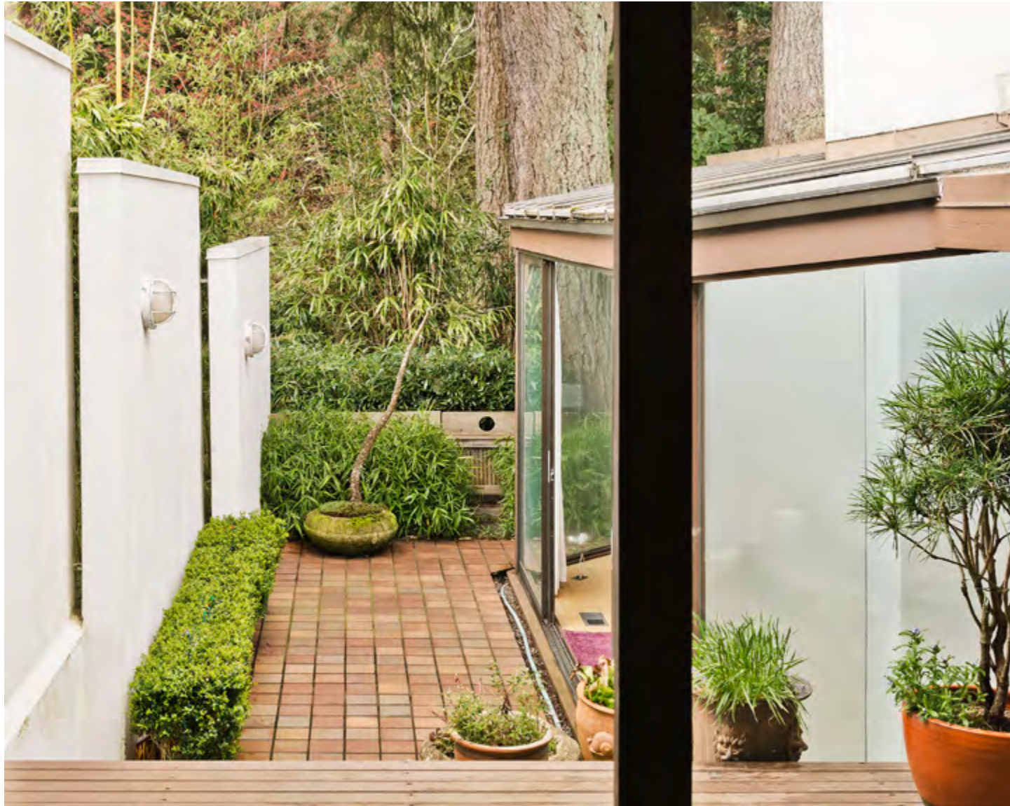
Step out the kitchen door onto a porch and down a few steps to the patio off the living room (at right).