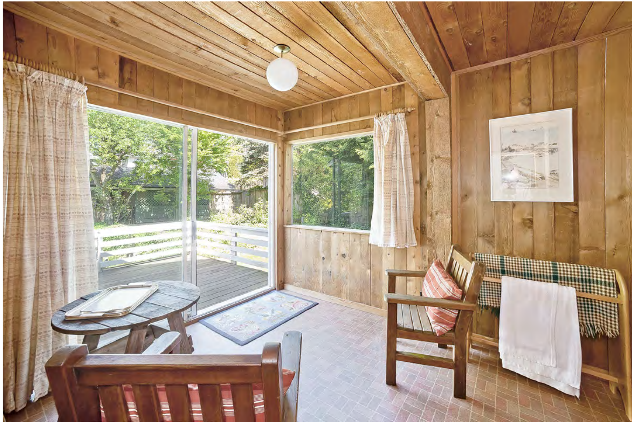
This room, adjacent to the kitchen, also provides access from the porch to the garden.