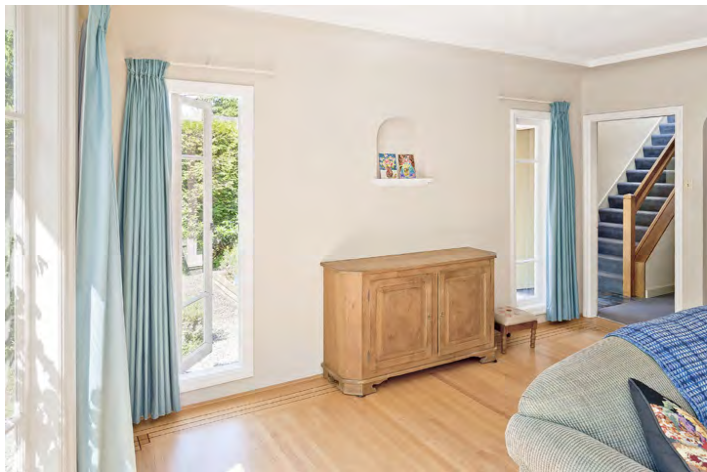
Catch a breeze through the living room's open west-facing window.