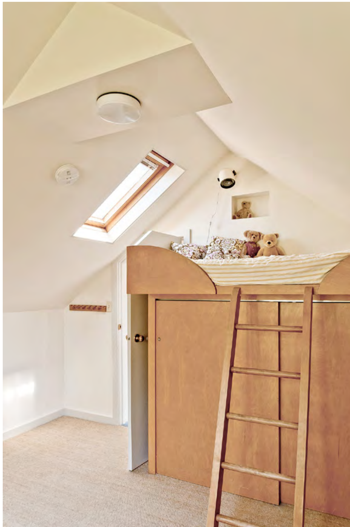
A custom bed with closet beneath affords a marvelous west-facing outlook.

This view looks toward Chaldecott Park, Queen Elizabeth Annex, Pacific Spirit Park and UBC.