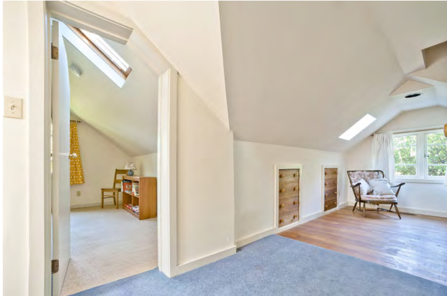
Skylights illuminate bedroom to left and den or playroom overlooking the back garden.