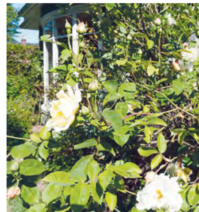
An expansive bay window defines this beautiful home inside and out.