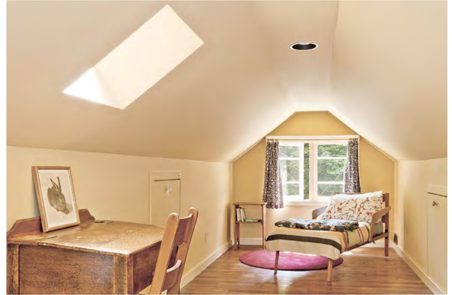
The long room with skylight may serve as a south-facing bedroom, den or a commodious dressing room for the master bedroom.