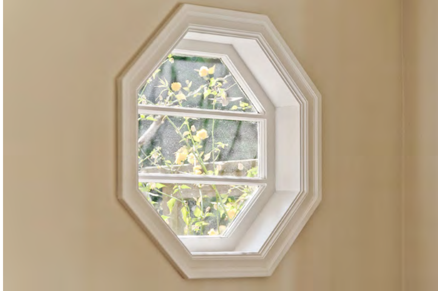
A hummingbird flickers while feeding at the spring flowers outside the octagonal window.