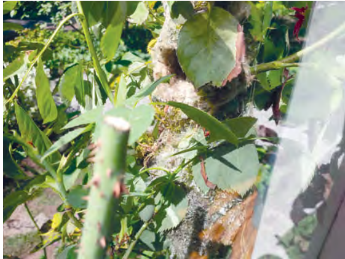
A bushtit nest is visible from the bay window, hidden amongst rosebush leaves.