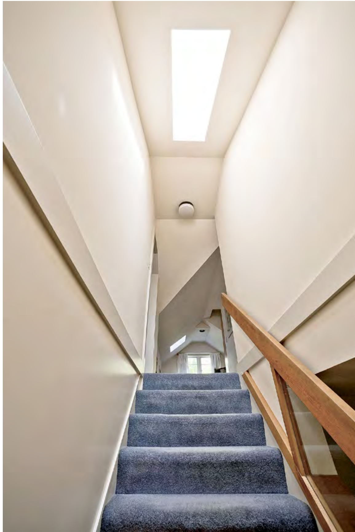
One of the five skylights installed on the upper floor cascades light down the central staircase.