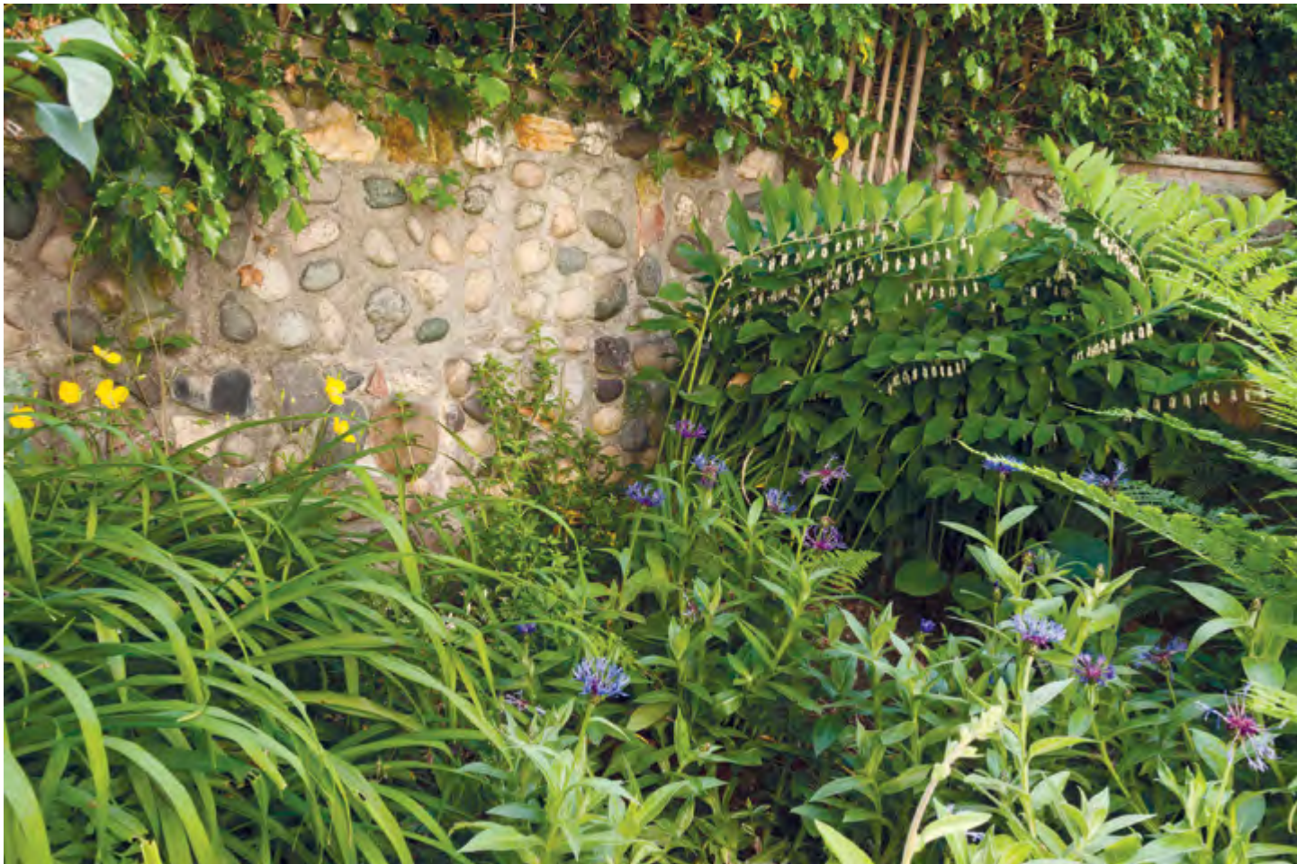
The garden blooms with cultivated roses and native plants among ferns and wild flowers against a cobblestone wall.