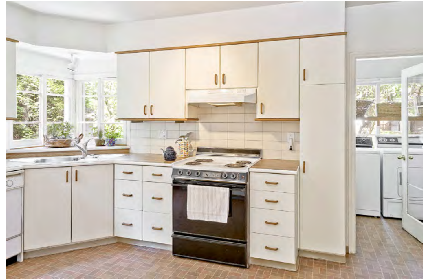
A northwest-corner window provides light for washing up at the corner sink. Herbs grown on the sill are mere steps to prep areas. Access to back-porch steps, garden and clothesline is through a second door (not shown) to the left of washing machine.