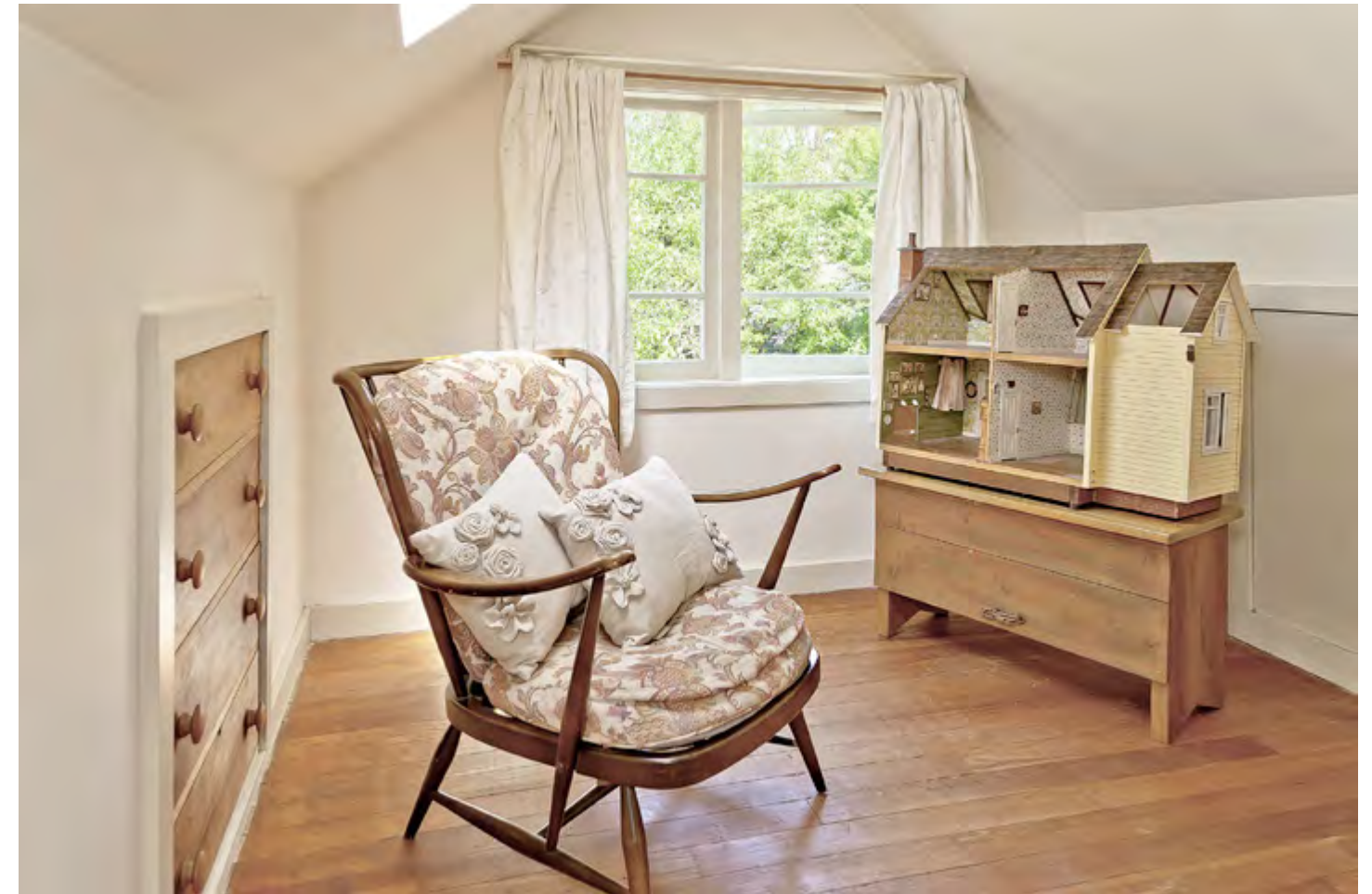
A landing at the top of the stairs becomes a light-filled nook.