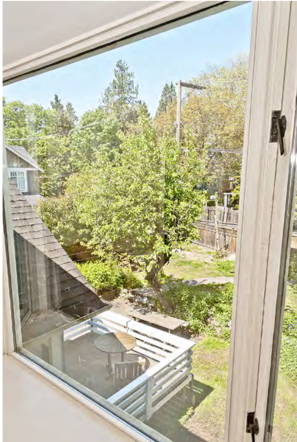
This north-facing bay window has a bird's-eye view of the 66'-wide garden. The trees of Chaldecott Park are in the distance and beyond that King Edward Boulevard and Camosun Bog.