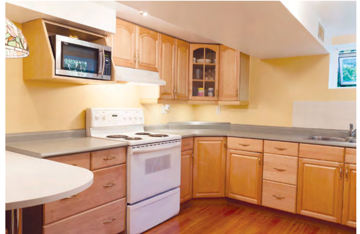
The lower floor boasts a tastefully appointed three-bedroom suite with private access and laundry.