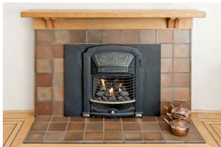
The separate dining room is sunlit during the day and the charm of firelight in the evening is hinted at in the living room.