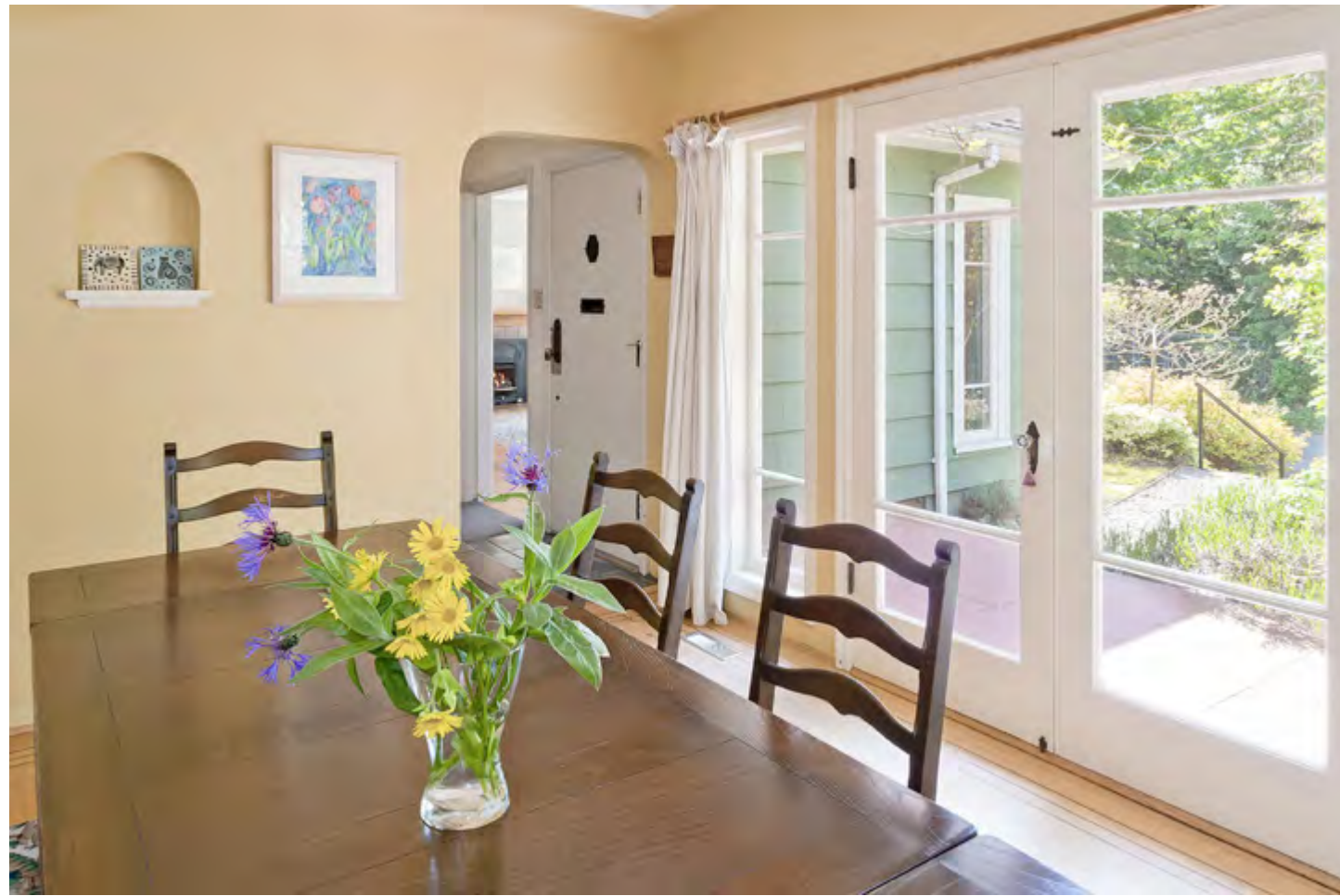
From the dining room step out to the front porch and look over to the evergreens of St. George's Junior School.