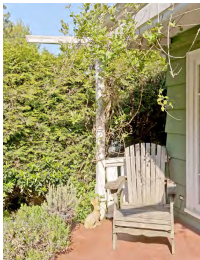
Step from the porch through French doors and into the dining room shown on next page.