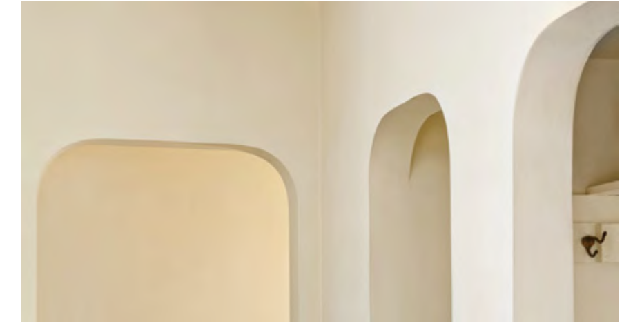
Rounded doorways reflect living room detail.