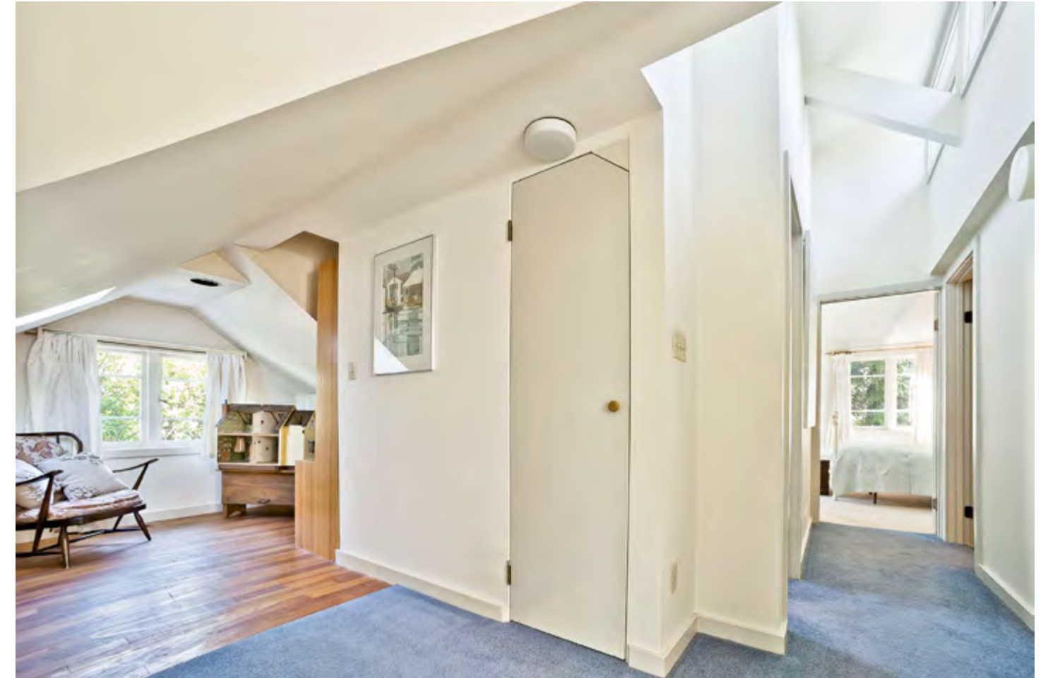
The upper-floor hall runs west to east gathering light throughout the day via south-facing transoms.