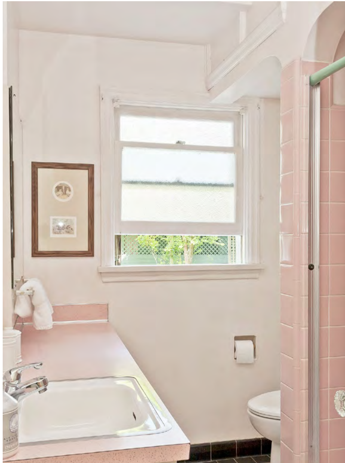
Across from the bedroom or playroom on the main floor is a full bathroom.