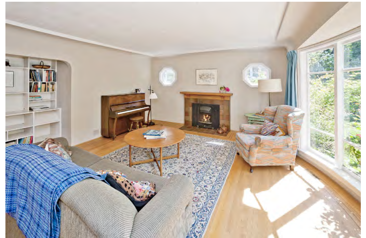
Room enough for an upright or baby grand piano.