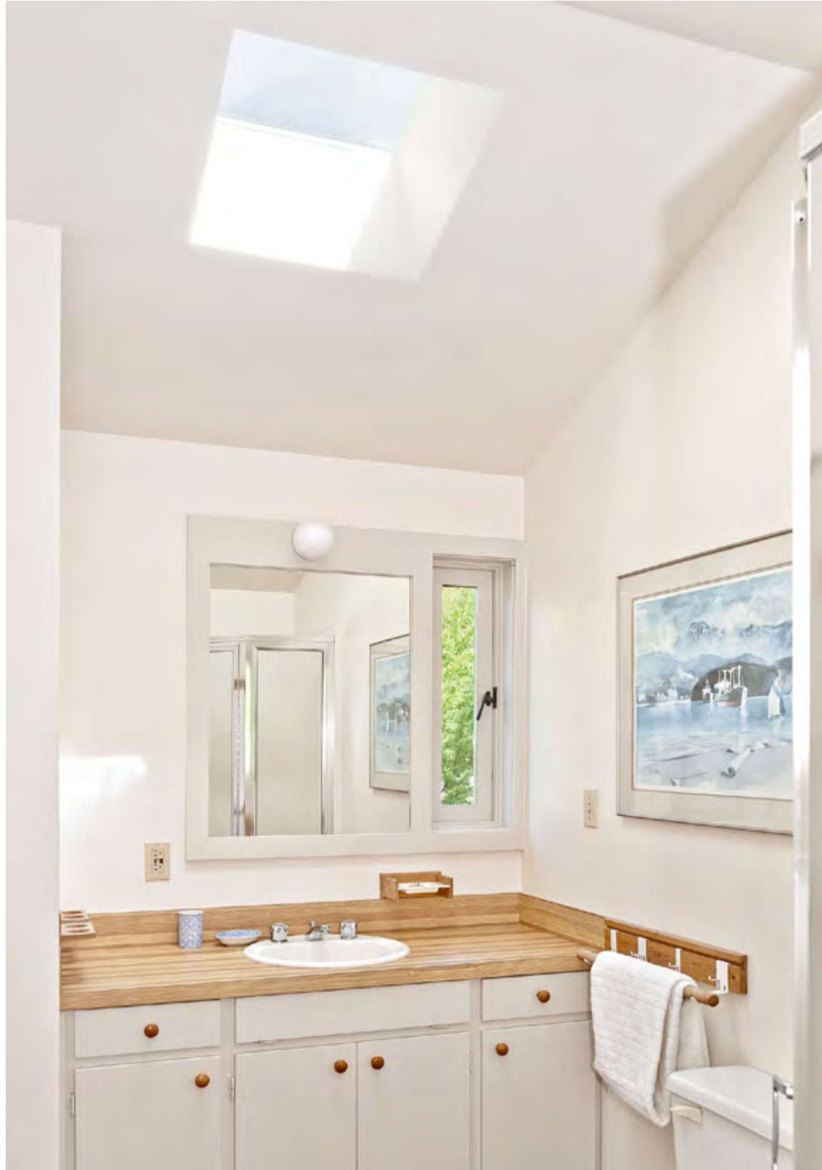
The upstairs bathroom is adjacent to the master bedroom and across the hall from the long room.