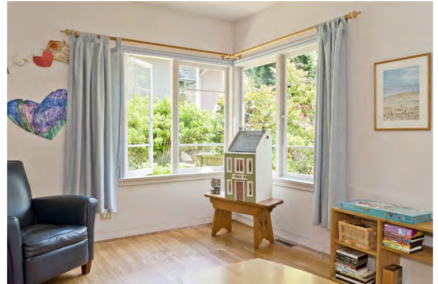
The playroom or main-floor bedroom is at the southeast corner and has a generous closet. As well, there are two doors, one of which may be used to access a landing and stairwell with windows that lead to the three-bedroom basement suite.