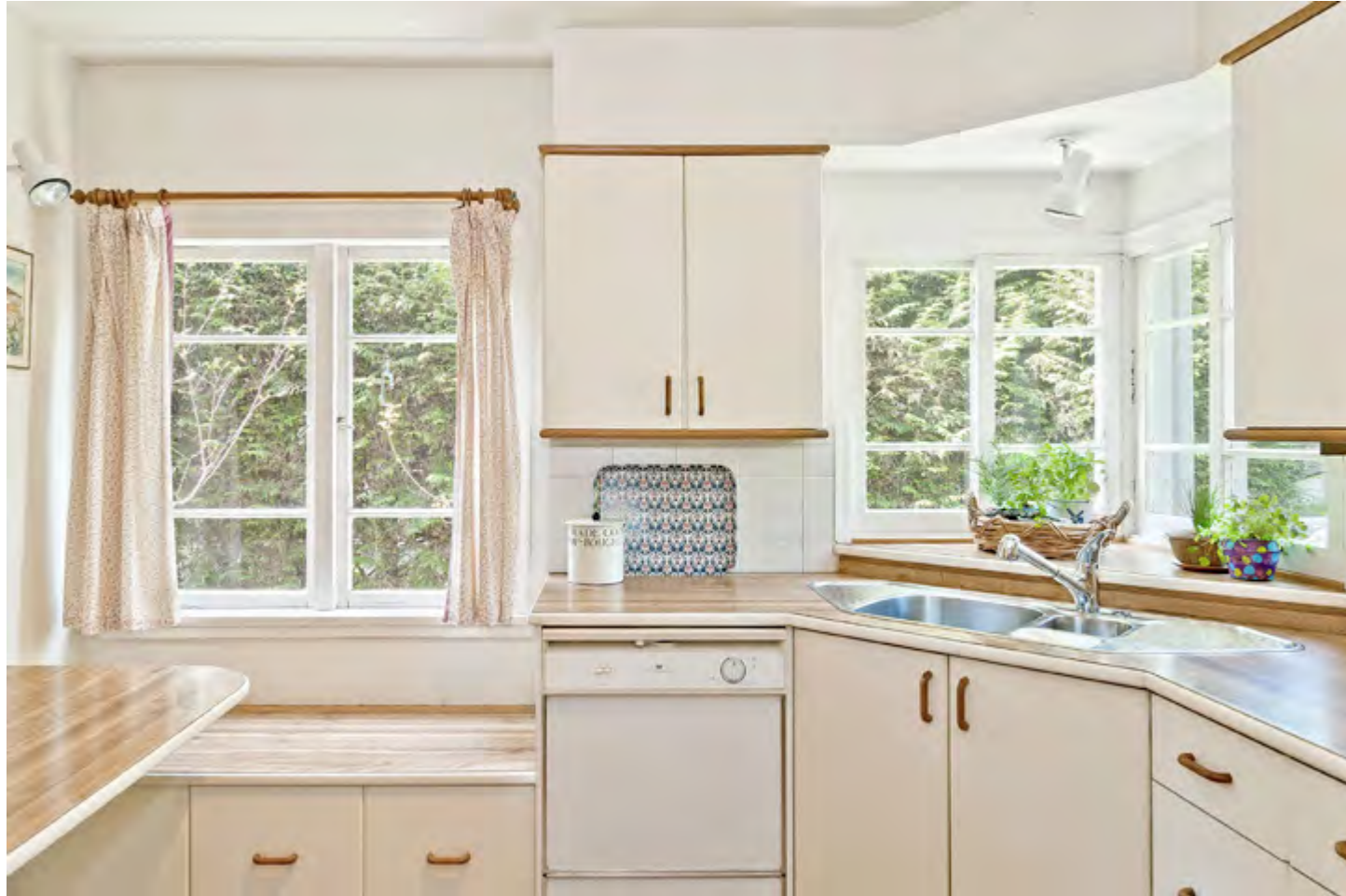
To the left of frame are shelves above the counter's work surface which doubles as an eating area. Alternatively, a separate table and chairs could fit in this space.